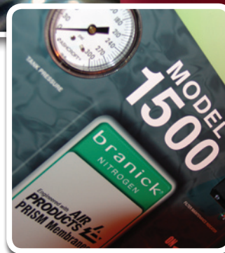
NITROGEN TIRE INFLATION