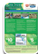
Customer Retention e-mail