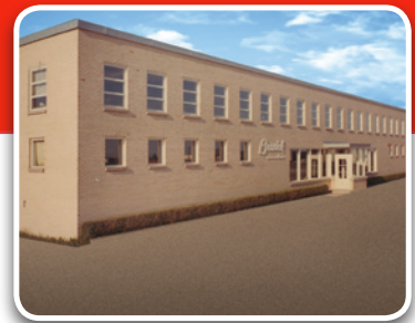
1957 Branick Industries, Inc. Third Avenue, Fargo, ND