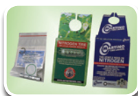
Road Assist & Tire Hazard