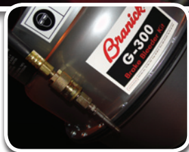
UNDER CAR SERVICE