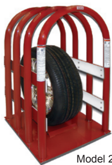
Model 2140 Run Flat No-Mar Cage!