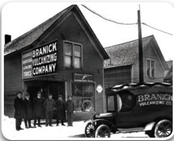
1917 Branick Vulcanizing Co. Front Street, Fargo, ND