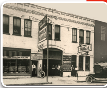
1921 Branick Vulcanizing Co. NP Avenue, Fargo, ND