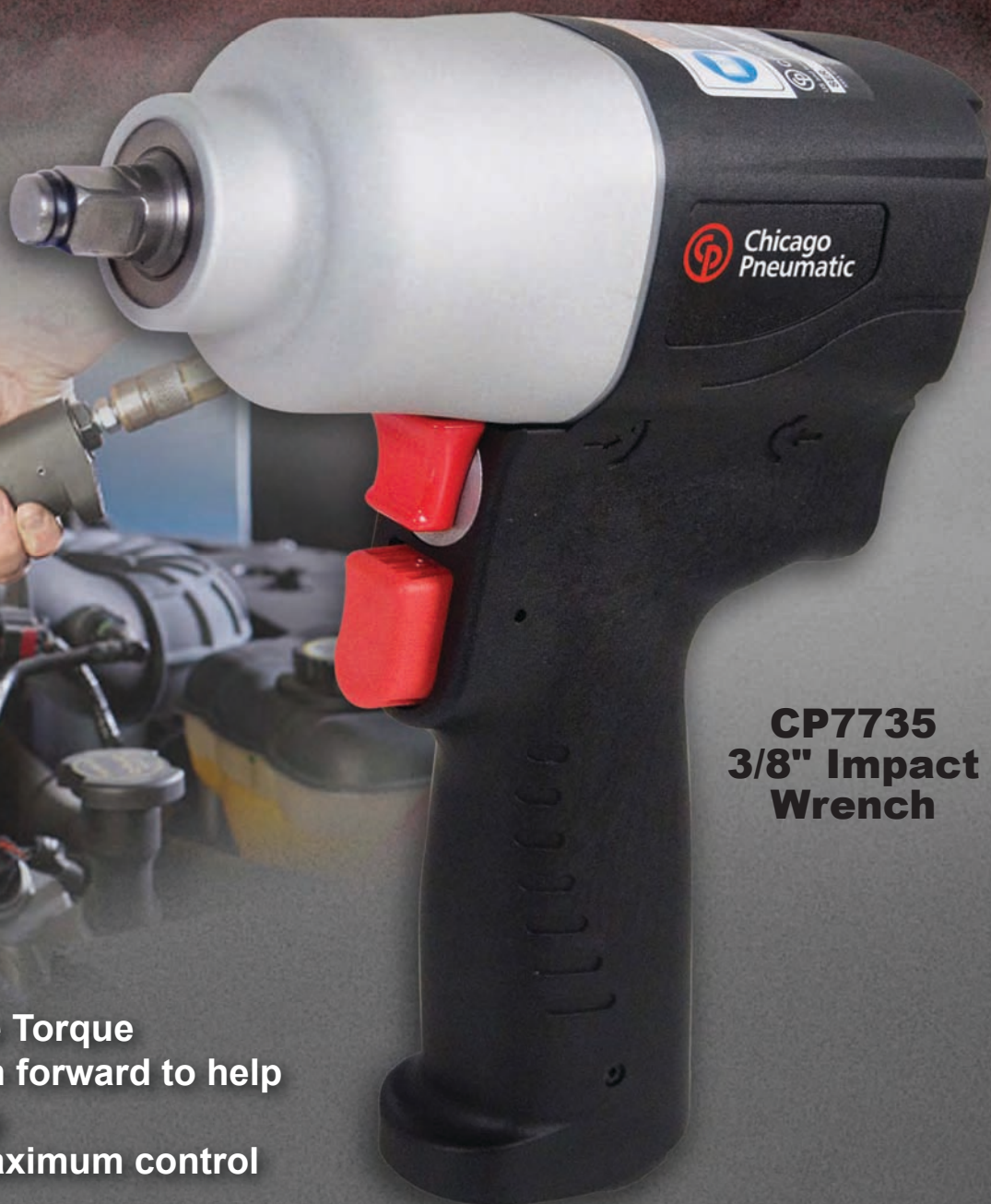
CP7735 3/8" Impact Wrench