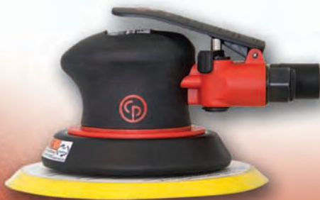
CP7255 - Orbit size 3/16" (5.0 mm)