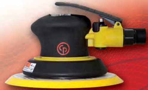
CP7225 - Orbit size 3/32" (2.5 mm)

Coupon enclosed with a sample pack of M, L, & XL gloves with every Sander Purchase!