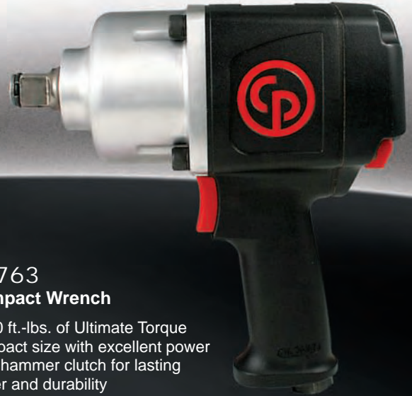
CP7763 3/4" Impact Wrench