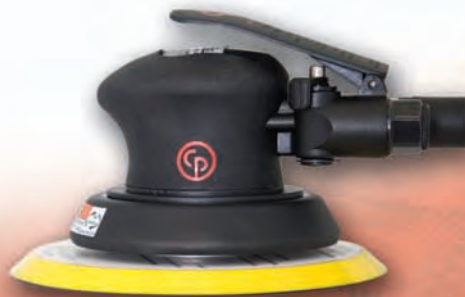
CP7215 - Orbit size 3/8" (10.0 mm)