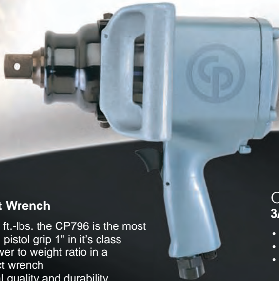
CP796 1" Impact Wrench